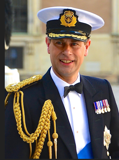
Charles Philip Arthur George, Anne Elizabeth Alice Louise, Andrew Albert Christian Edward, Edward Antony Richard Louis